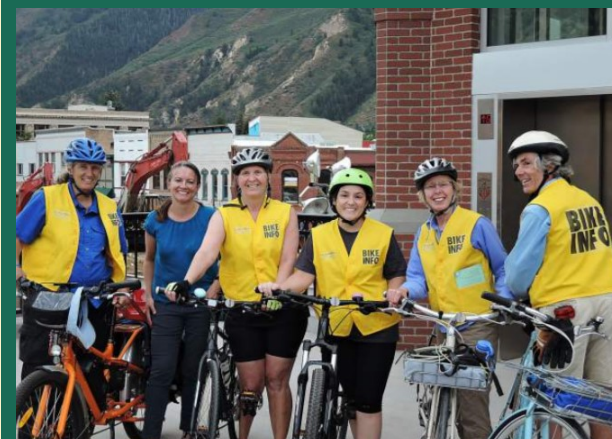
Yellow-vested ambassadors gave advice and supplemented police force as part of the “Happy Trails” campaign.