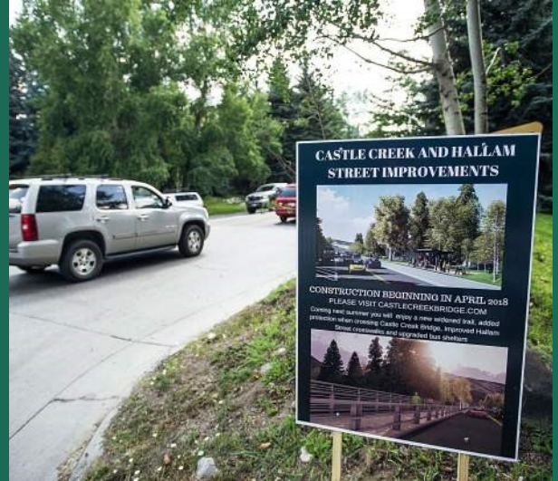
Traffic at the S-curves on Highway 82 in Aspen of cars headed down valley at rush hour on Tuesday.